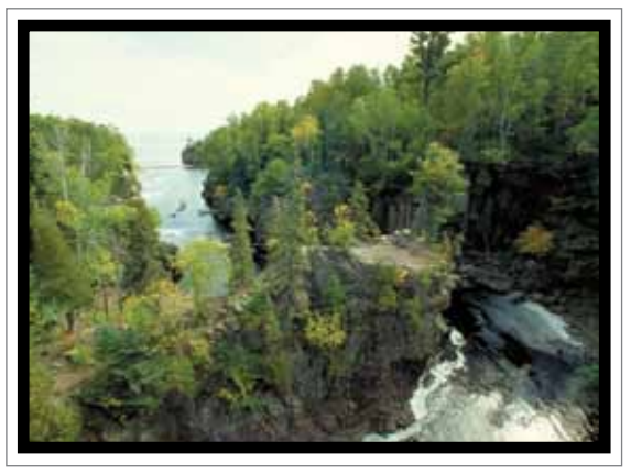
North Shore stream flows into Lake Superior in Minnesota.

There is never a bad time to visit the North Shore. Whether it's skipping rocks on the clear Superior waters in the summer, watching the fall colors paint a breathtaking canvas of red, orange, and yellow, strapping on skis or