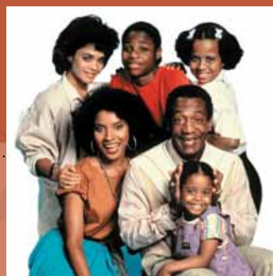
The Huxtable family from The Cosby Show .