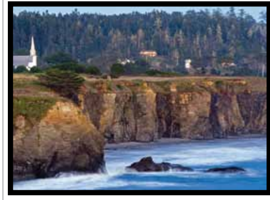
Mendocino Coast, California.

wine-tasting tours, canoeing excursions down the Big River, bicycle explorations through the redwoods and fern canyons of nearby state parks, and visits to the botanical gardens located on 47-oceanfront acres that include