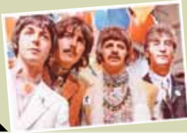
1. Mercury and Venus 2. Anne Hathaway 3. John Lennon