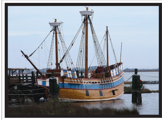
The Elizabeth II at Roanoke Island Festival Park.

☛ For more information about this area, visit: www.roanoke-island.com