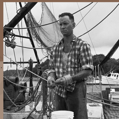
Tom Hanks as Forrest Gump .