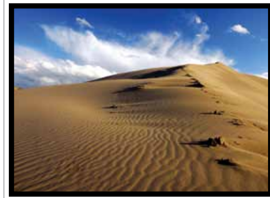
Bruneau, Idaho sand dunes.

Opposing wind currents serve to trap vast amounts of sand in a semicircular basin, which cause massive sand piles to form. One of these piles stands at 470 feet, making it the tallest freestanding dune in North America. Visitors are welcome to explore the dunes on foot, but no motor vehicles are allowed.