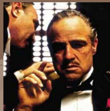
Marlon Brando in The Godfather